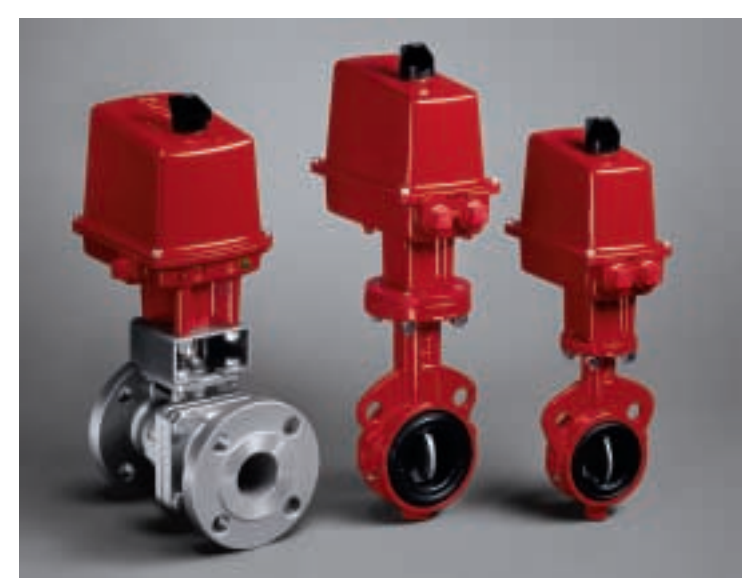
The Bray R<sup>5™</sup> Electric Actuator – Series 73-6 on Flow-Tek flanged ball valve, Series 73-3 and -1 on Bray Series 20 butterfly valves.