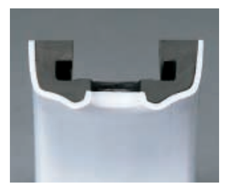
Seat cross-section at stem hole.

BRAY'S UNIQUE SEAT DESIGN is one of the valve's key elements. The elastomer backed PTFE seat features a tongue and groove retention method which holds securely between either slip-on or weld-neck flanges and also allows simple and fast field replacement. This EPDM backing provides resilient support for the molded PTFE, thus maximizing the shut-off and cycle life of the seat.